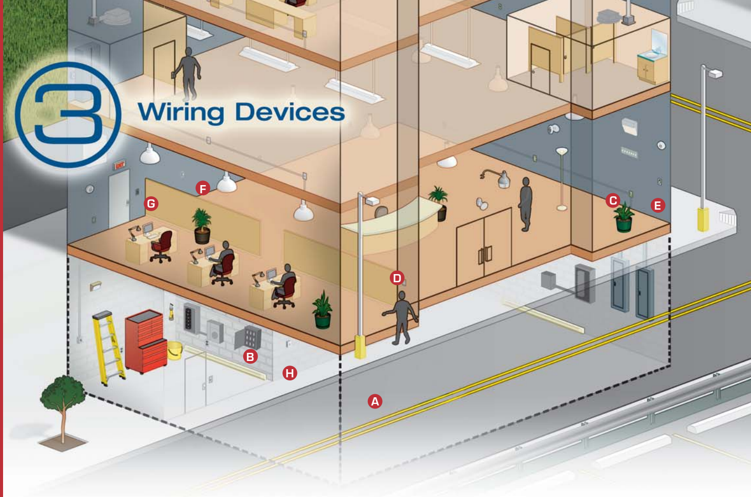
A Locking Wiring Devices