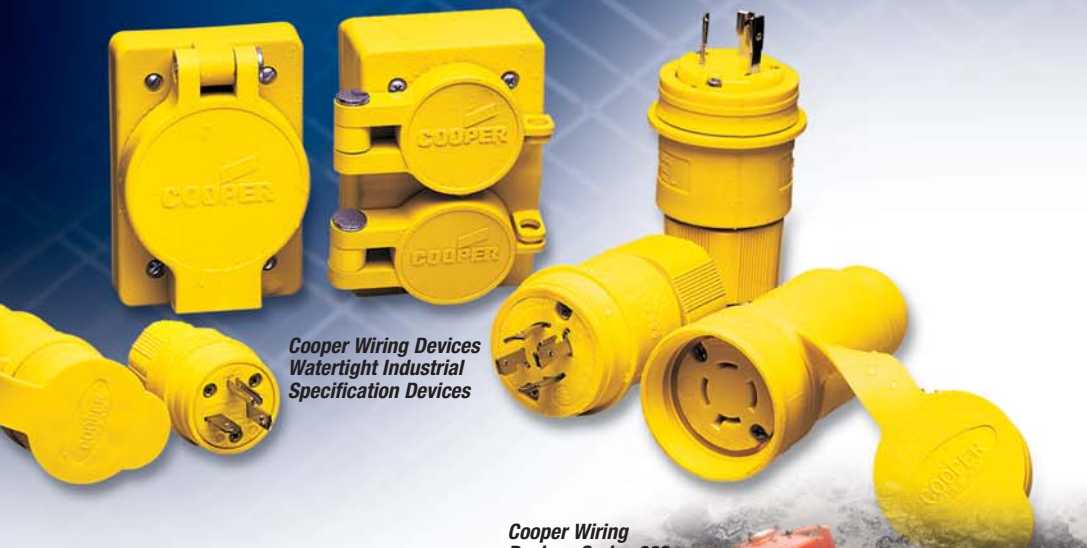
Cooper Wiring Devices Watertight Industrial Specification Devices