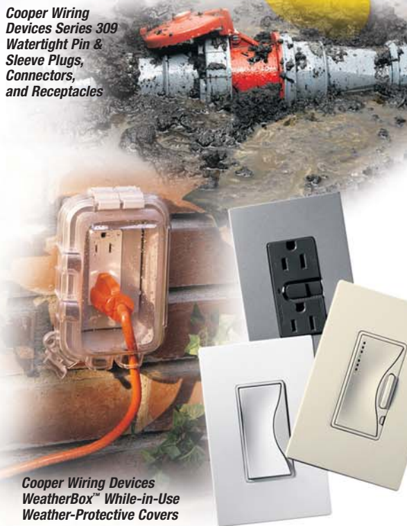
Cooper Wiring Devices WeatherBox™ While-in-Use Weather-Protective Covers